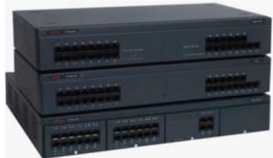
** Depicted controller might not be configured for the server edition of IP Office

Avaya IP Office is the right choice for any small or medium business, regardless of size and the number of locations. This flexible solution provides your employees the tools to handle all of their business communications using the device of their choice—laptop, mobile phone, office phone, home phone, or iPad—and the connection of their choice over IP, digital, analog, SIP, or wireless. It delivers unified communications in a single compact solution with leading-edge capabilities that help your employees work better and serve your customers more effectively and efficiently.